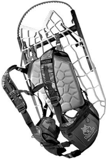
THE WOLF PACK™

SEE THE LATEST FROM LONE WOLF AT WWW.LONEWOLFSTANDS.COM