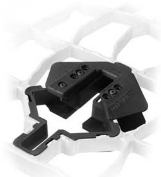
WOLF JAWS™ "COMBO"